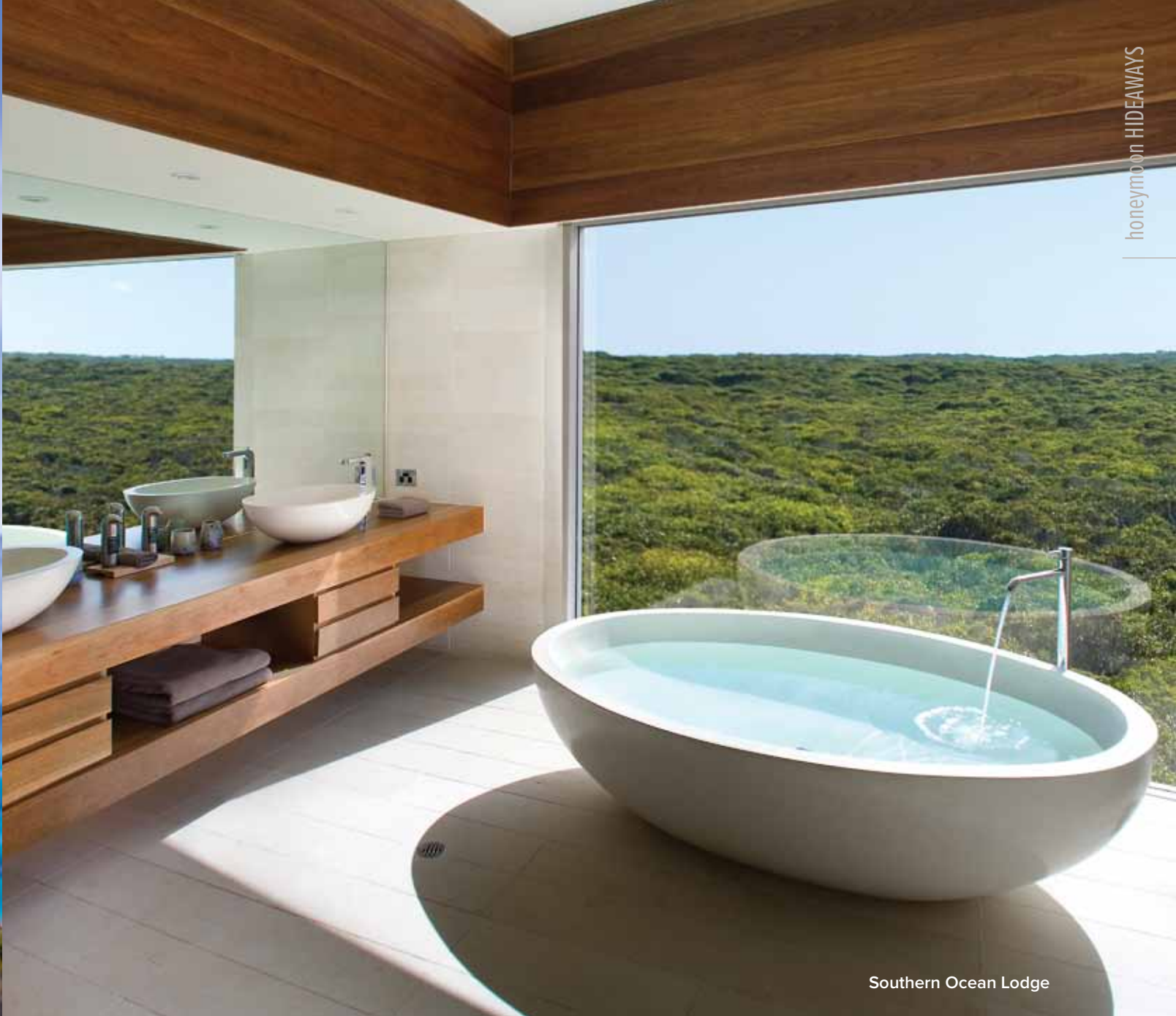
Southern Ocean Lodge

a glass of bubbly, creative cuisine, Tasmanian wines, cotton pjs and comfy chair beds. They cater to glamorous gastronomists.