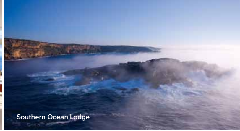
Southern Ocean Lodge