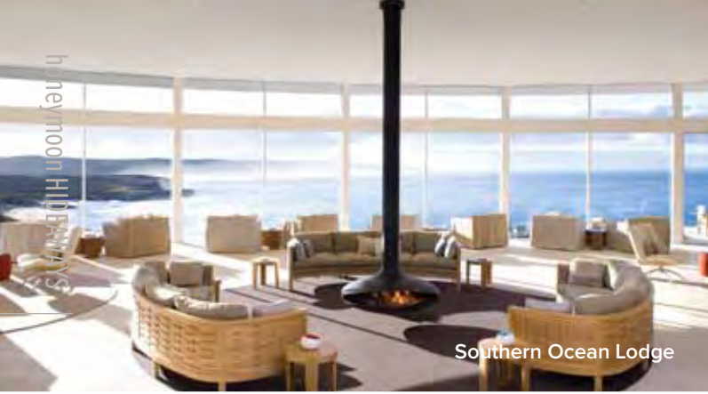
Southern Ocean Lodge